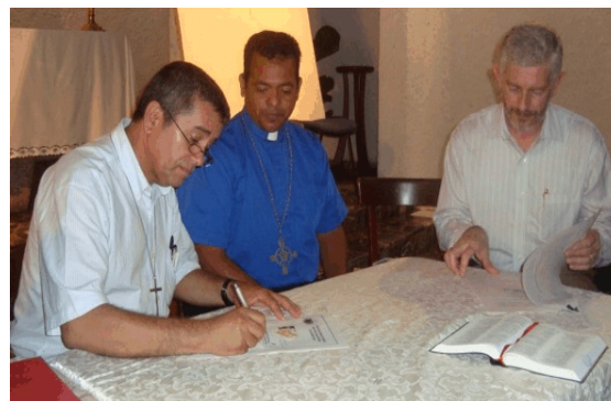
Signing documents at the LCV convention

From 20 to 22 November 2009, the 49 th Plenary Assembly of the Lutheran Church of Venezuela convened at El Salvador Lutheran Church in Caracas.