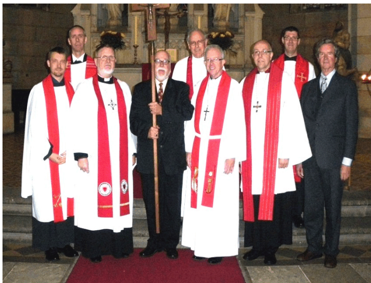
Officiants after the Retirement and Installation Service